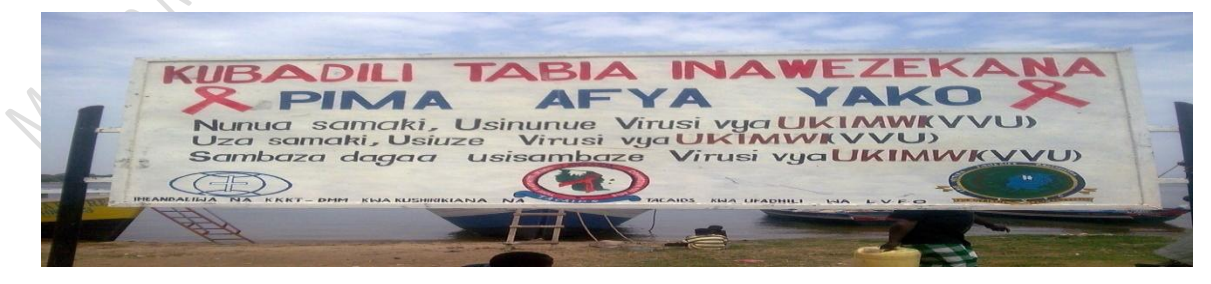
Figure 2: Sign boards found on the Island

Behavioral Change Communication-In attaining this, several initiatives have been done. This included developing sign boards. 4 sign boards have been developed with a message reads "Kubadili tabia inawezekana, Pima Afya yako, "Nunua samaki, Usinunue VVU, Uza samaki Usiuze VVU, sambaza Dagaa, usisambaze VVU". Literary meaning "Behavioral Change is Possible, Do clinical Test, Buy Fish not HIV, Sale Fish not HIV, Scatter sardines[dagaa] not VVU' as see hereunder. These sign boards have designed by ELCT TACAIDS and LVFO. Comparing the message on the sign board and the targeted audience, fishermen and women are targeted by the message. Fishermen and women who are directly or indirectly involved in fishing sector are the ones blamed to fuel the spread of HIV and AIDS among fishing communities (Gordon, 2005; Karukuza and Bob,2005; Mgabo, 2009). Fishermen have money and they can even buy sex from women who deal with fish processing especially for Nile perches (Sangara) and those who scatter sardine to dry on sun and most of them also involve in commercial sex sometimes they exchange fish with sex. The message on sign board-Buy Fish not HIV, Sale Fish not HIV, Scatter sardines [dagaa] not VVU' is trying to urge them from unhealthy behavior and practices with can lead to encountering HIV infections.